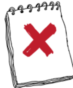
Extra information - books, notes, sketches or paper, and anything written on your clothes or body