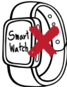
Electronic devices such as iPods, tablets, smartwatches or any other device that stores information or can connect to the internet