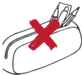
Pencil cases or calculator cases