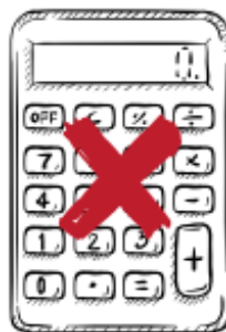
Calculators, except for exam papers where calculators are allowed