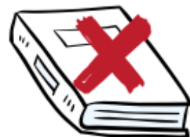
Dictionaries, except for exam papers where dictionaries are allowed