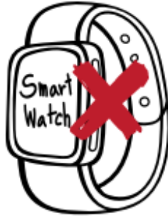
Electronic devices such as iPods, tablets, smartwatches or any other device that stores information or can connect to the internet